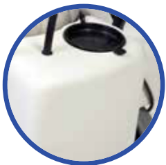
External detergent tank